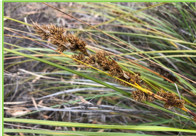
(Sando, D, iNaturalist Australia)