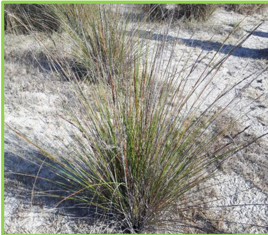
(Irvine, K, iNaturalist Australia)