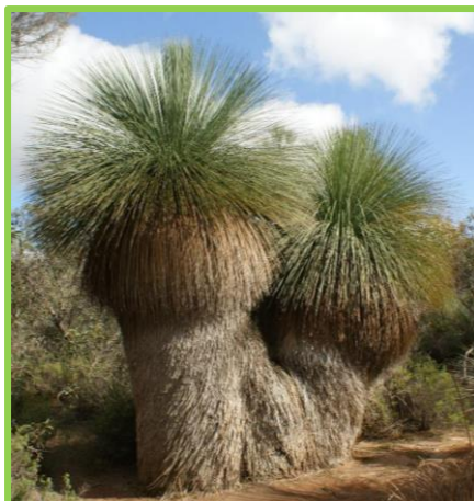
(Hura, M, iNaturalist Australia)