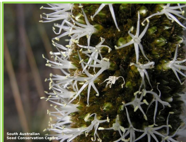
(Murfet, D, Seeds of South Australia)