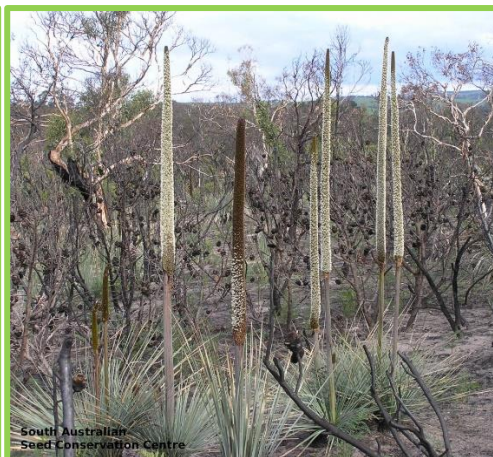
(Murfet, D, Seeds of South Australia)