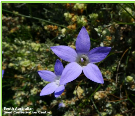
(Murfet, D, Seeds of South Australia)