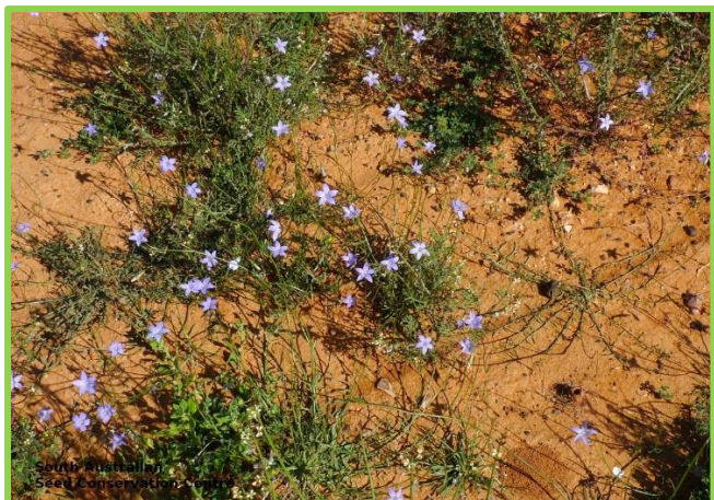
(Murfet, D, Seeds of South Australia)