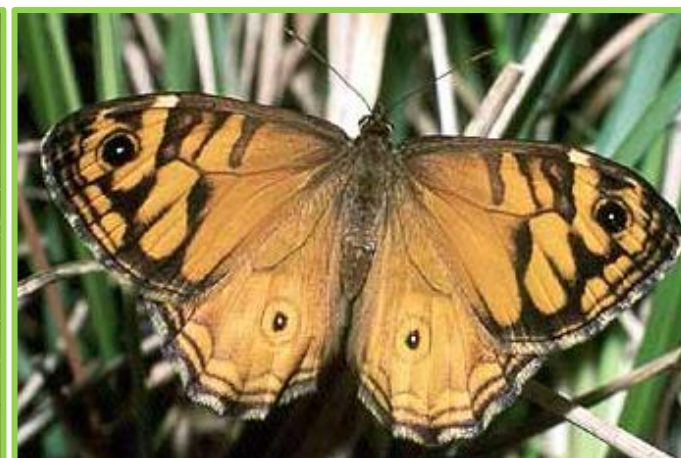
Adult Ringed Xenica