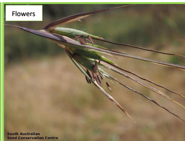
(Murfet, D, Seeds of South Australia)