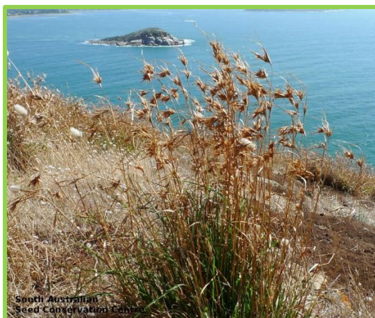
(Murfet, D, Seeds of South Australia)