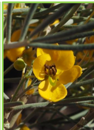
(Murfet, D, Seeds of South Australia)