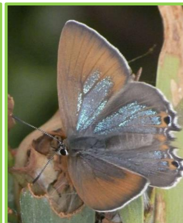
(Best, R, iNaturalist Australia)