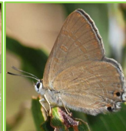
Adult Icilius Hairstreak