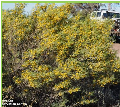
(Murfet, D, Seeds of South Australia)