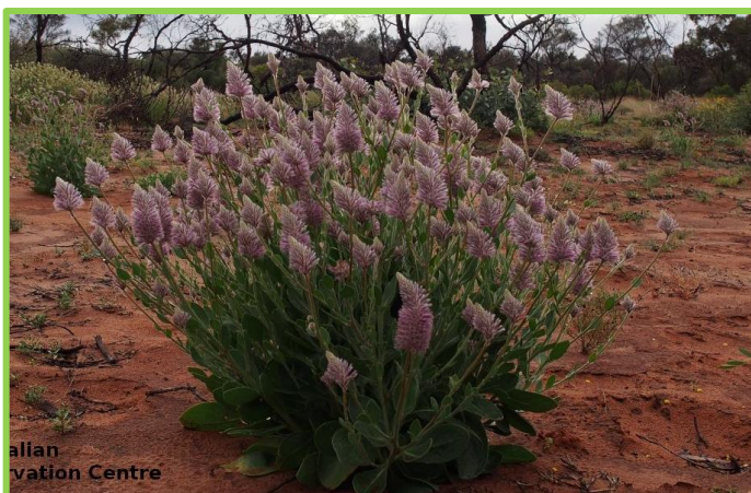
(Seeds of South Australia)