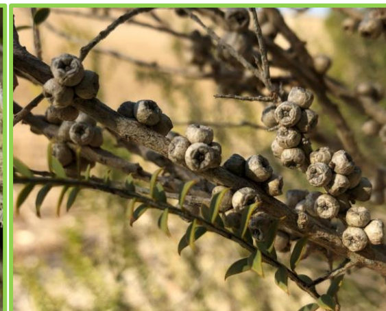
(Sando, D, iNaturalist Australia)