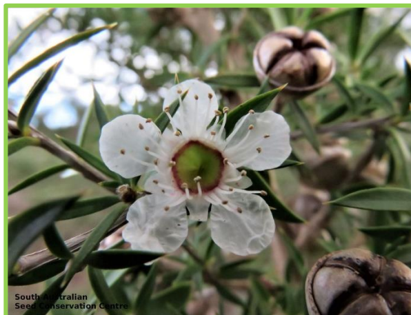
(Taylor, R, Seeds of South Australia)