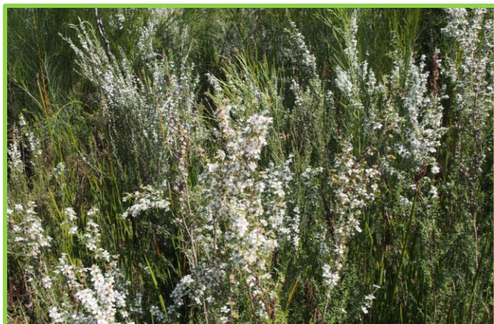
(Seeds of South Australia)