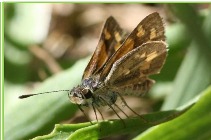
Adult Ina Grass-dart