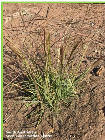
(Seeds of South Australia)