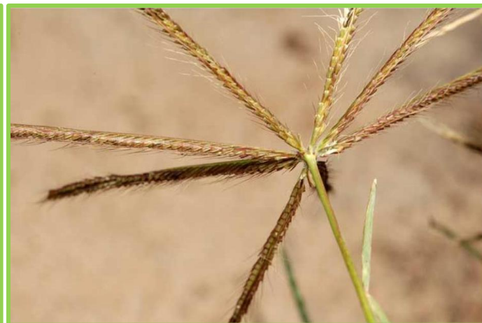
(Fagg, M, Australian Plant Image Index)

Form: Sedge or Flax Height: 0.3 – 0.5 m Spread: 0.3 – 0.5 m Flowers: Brown Type: Panicles Flowering time: Spring, Summer