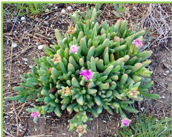
(Cox, G, iNaturalist Australia)