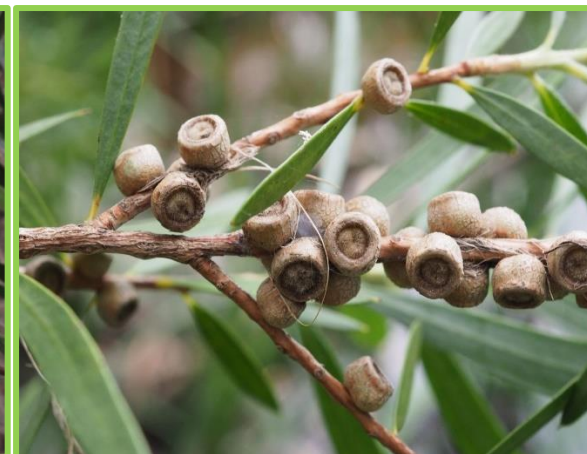
(Seeds of South Australia)

Form: Medium shrub Height: 1 – 2 m Spread: 1 – 1.5 m Flowers: Cream, Yellow Type: Bottlebrush Flowering time: Spring, Autumn