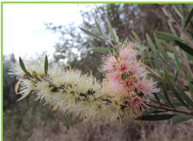
(Bedingfield, M, Canberra Nature Map)