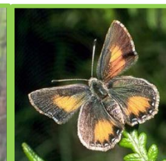
Adult Bright Copper (top) and adult Dull Copper (bottom)