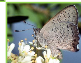
(SA Butterflies & Moths)