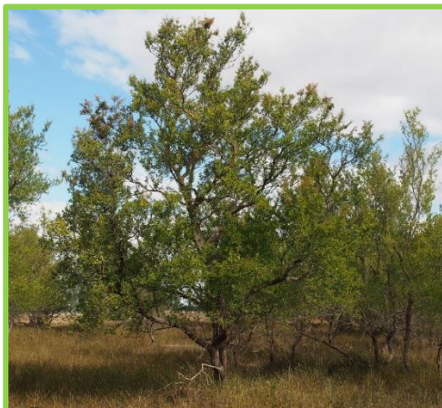
(Seeds of South Australia)