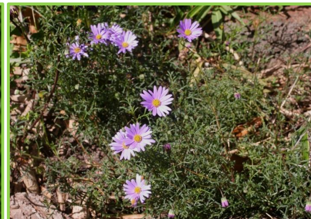
(Lay, G, Flora of Victoria)

Form: Ground cover Height: 0.3 – 0.4 m Spread: 0.5 – 0.6 m Flowers: Pink Type: Star Flowering time: Spring, Summer