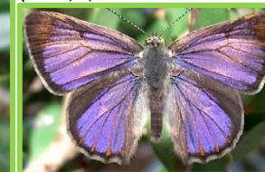
(SA Butterflies & Moths)

Adult female Fiery Jewel from Yorke Peninsula, males resemble the appearance of females.