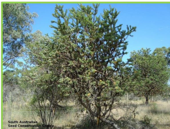
(Seeds of South Australia)