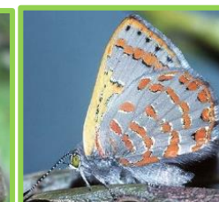
(Hunt, L, SA Butterflies & Moths)