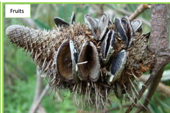
(Seeds of South Australia)