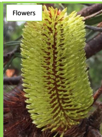
(Rappman, iNaturalist Australia)