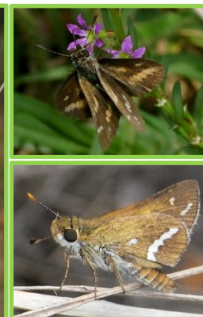
Adult White- banded Grass-dart