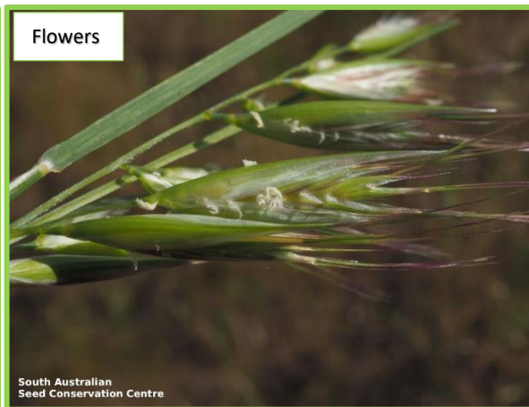
(Murfet, D, Seeds of South Australia)