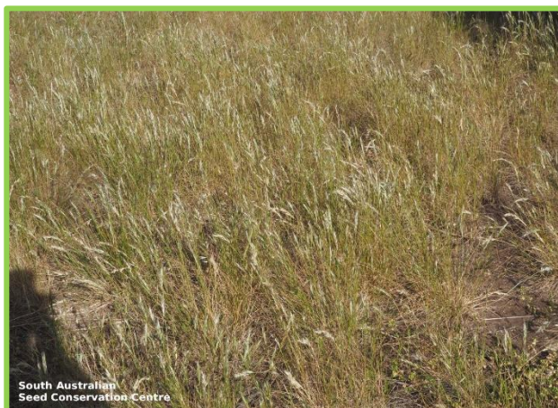
(Murfet, D, Seeds of South Australia)