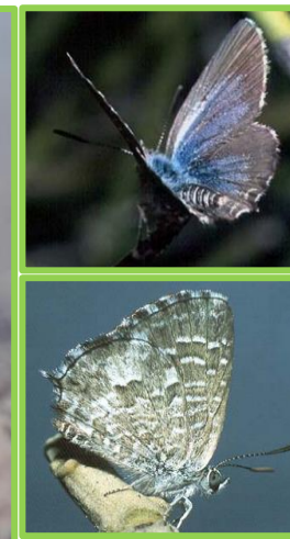
Female (top) and male (bottom) Salt-bush Blue butterflies