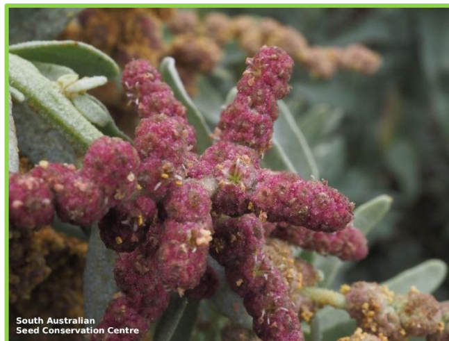
(Murfet, D, Seeds of South Australia)