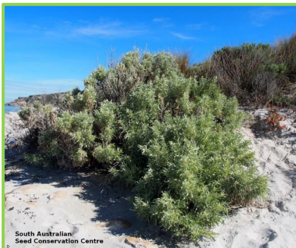
( Atriplex cinerea , Seeds of South Australia)