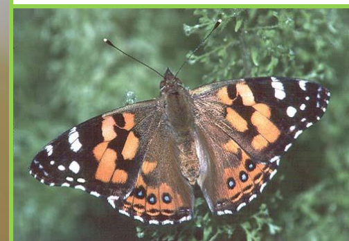
An adult Australian Painted Lady