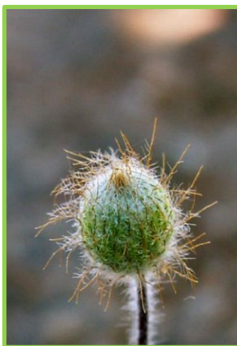
(Taylor, R, Seeds of South Australia)