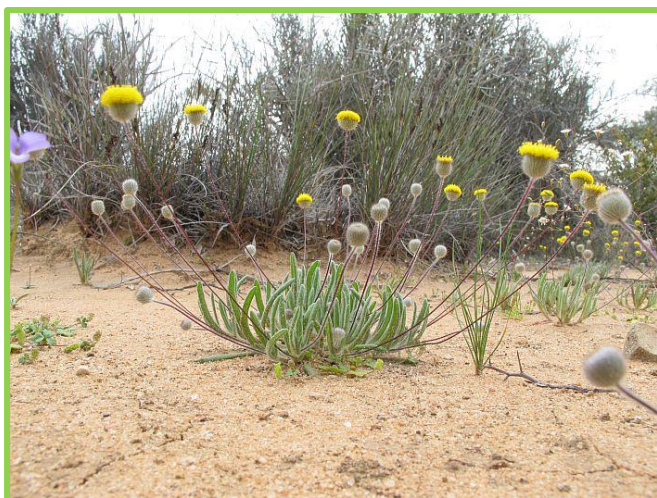
(Archer, W, Esperance Wildflowers)