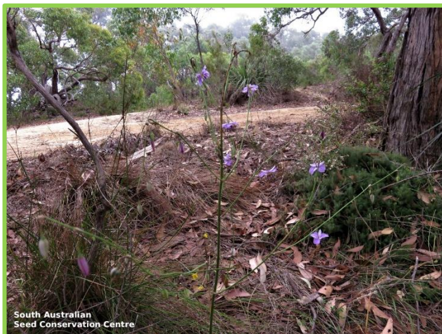
( Arthropodium fimbriatum , Seeds of South Australia)