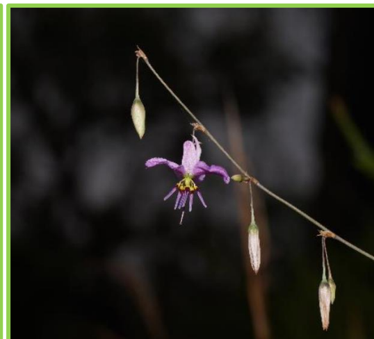
(French, G, iNaturalist Australia)

Form: Ground cover Height: 0.8 – 1 m Spread: 0.6 – 0.8 m Flowers: Pink Type: Open-petalled Flowering time: Spring, Summer