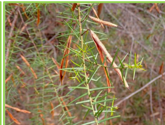
(Cox, G, iNaturalist Australia)