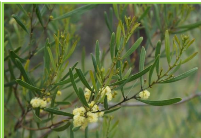
(Murfet, D, Seeds of South Australia)