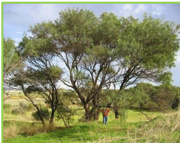
(Maslin, B.R., Worldwide Wattle)