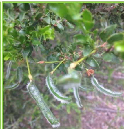
(Acacia paradoxa, Seeds of South Australia) (Hunter, L, iNaturalist Australia)