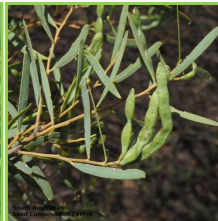
(Murfet, D, Seeds of South Australia)