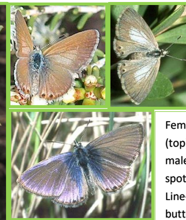
Females (top) and male Two-spotted Line-Blue butterflies