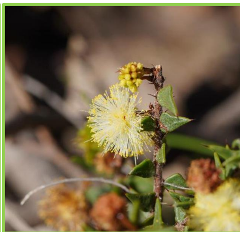
(Reiner, R, iNaturalist Australia)