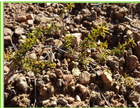
(Preston, T, Canberra Nature Map)

Form: Low shrub Height: 0.3 – 0.5 m Spread: 1 – 2 m Flowers: Yellow Type: Globular Flowering time: Spring, Winter