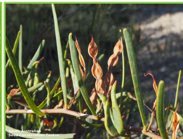
(Murfet, D, Seeds of South Australia)

Form: Ground cover Height: 0.2 – 0.3 m Spread: 2 – 3 m Flowers: Yellow Type: Globular Flowering time: Spring