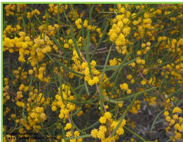
(Murfet, D, Seeds of South Australia)